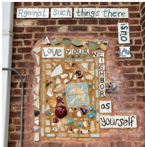
This reminder can be seen on an outside wall of The REFORMED CHURCH OF HIGHLAND PARK