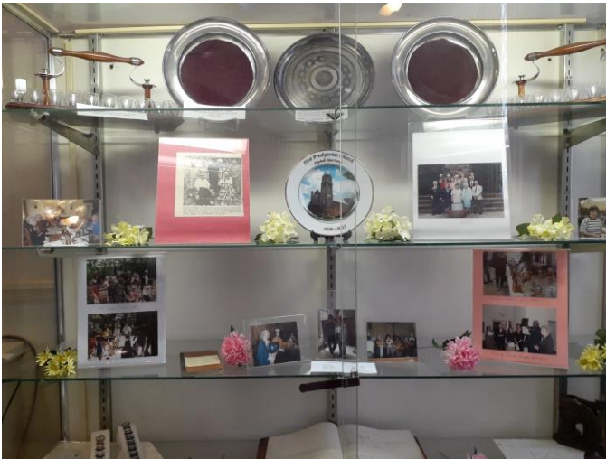
Historic Records Summer 2024

The Historic Records Committee maintains the display case in the back of the sanctuary. The committee changes the display each month or by the liturgical season.